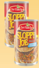
Our Family Sloppy Joe Sauce 15 oz Can