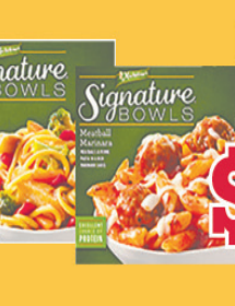
Michelin's Microwaveable Bowls 4.5-8 oz Package