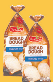
Our Family Bread Dough 80 oz Package