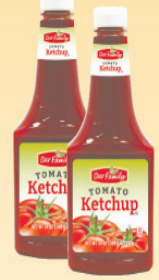
Our Family Ketchup 24 oz Bottle