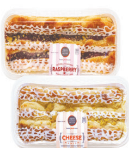
Open Acres Danish Coffee Cakes Assorted Varieties