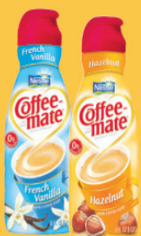
Coffee-Mate Creamer 32 oz Bottle