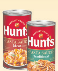
Hunt's Pasta Sauce 24 oz Can