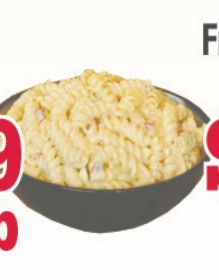
Deli Fresh Deviled Egg Pasta Salad