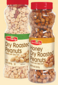
Our Family Peanuts 16 oz Jar