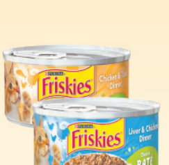
Frisky Cat Food 5.5 oz Can