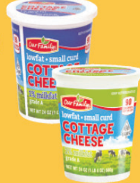
Our Family Cottage Cheese 24 oz Tub