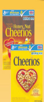
General Mills Original, Honey Nut or Multigrain Cheerios 12-15.5 oz Package