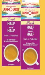
Land O Lakes Half & Half 1 Quart Carton