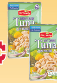
Our Family Tuna 2.6 oz Pouch