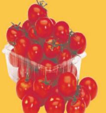
Grape Tomatoes 1 Pint Package