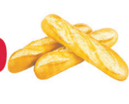
Take & Bake Bread Assorted Varieties