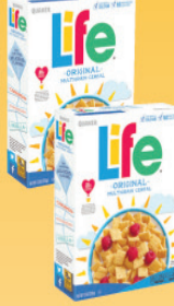
Quaker Life Cereal 13 oz Package