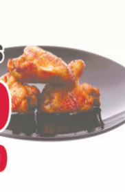
Deli Fresh Chipotle BBQ Chicken Wings