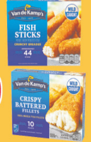
Van de Kamp's Fish Sticks or Fillets 18-24.6 oz Package