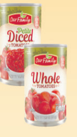
Our Family Tomatoes 14.5-15 oz Can