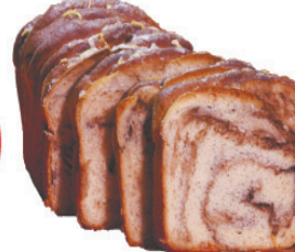
Cinnamon Bread 1 lb Loaf