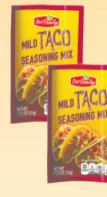
Our Family Taco Seasonings 1.25 oz Package