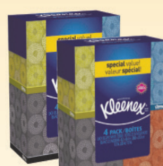
Kleenex Facial Tissue 4 Pack 65 Sheet Box