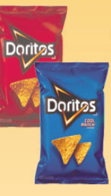
Doritos 9.75 oz Bag