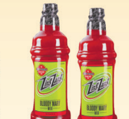
Zing Zang Bloody Mary Mix 1.75 Liter Bottle