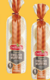
Our Family English Muffins 12 oz Package