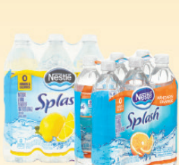
Nestle Splash Water 6 Pack