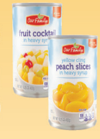
Our Family Canned Fruit 14.5-15.25 oz Can