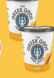
Greek God Greek Yogurt 24 oz Tub