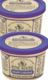
Pine River Cheese Spreads Assorted Varieties