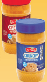
Our Family Peanut Butter 16 oz Jar