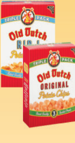
Old Dutch Triple Pack Chips 15 oz Box