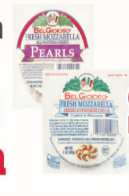
Belgioioso Fresh Mozzarella Assorted Varieties