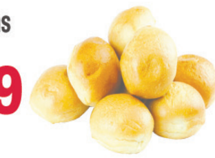
Cocktail Buns 12 Count