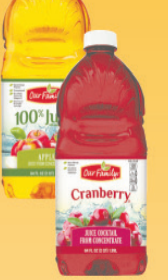
Our Family Juice 64 oz Bottle Assorted Varieties