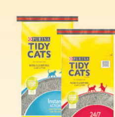
Tidy Cat Kitty Litter 20 lb Bag