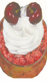
Deli Fresh Cherry Confetti