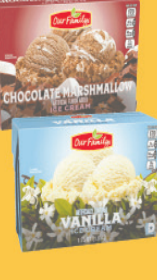
Our Family Ice Cream Squares 56 oz Package