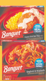
Banquet Microwavable Meals 7.4-11.88 oz Package