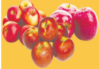
Honey Crisp, Braeburn or Pink Lady Apples