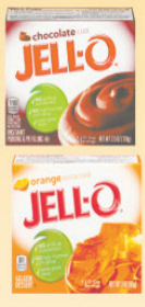
Jell-O Pudding or Gelatin .3-3.4 oz Box