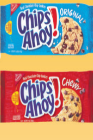
Nabisco Chips Ahoy! Cookies 11.75-13 oz Package