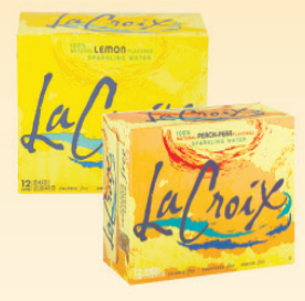
La Croix Sparkling Water 12 Pack Cans