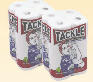
Tackle Paper Towels