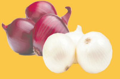
Red or White Onions 2 lb Bag