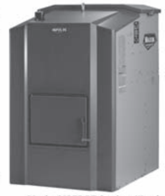
Maxim M255 PE Outdoor Wood Pellet and Corn Furnace

Convenience - Simply fill the large integrated hopper and enjoy days of heat from a single load.