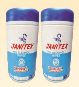
Janitex 75% Alcohol Wipes 80 Count Wipes